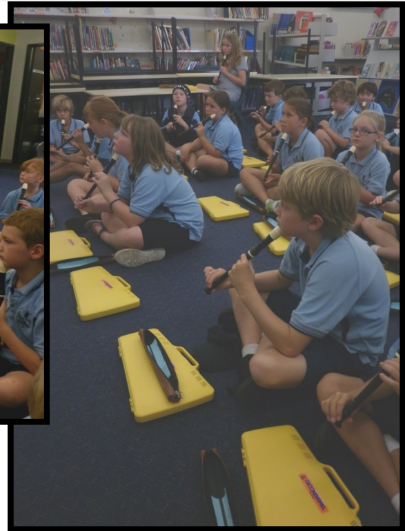
Students in 2/3/4 enjoying their first Jellybeans Class