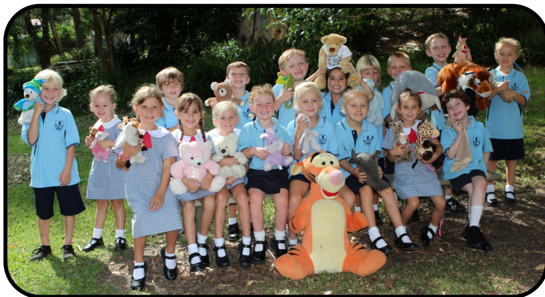
K/1 with their new friend Tigger at the Teddy Bears Picnic last week