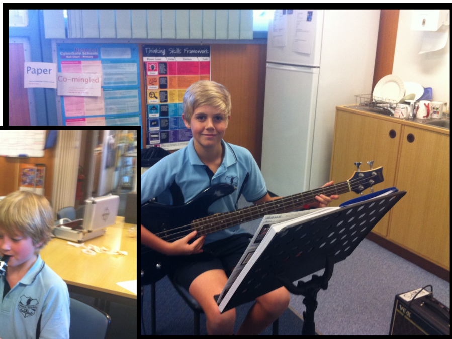
Some of our students enjoying Band lessons this week. The smiles say it all!