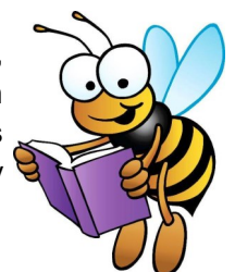
Master Spelling Bee